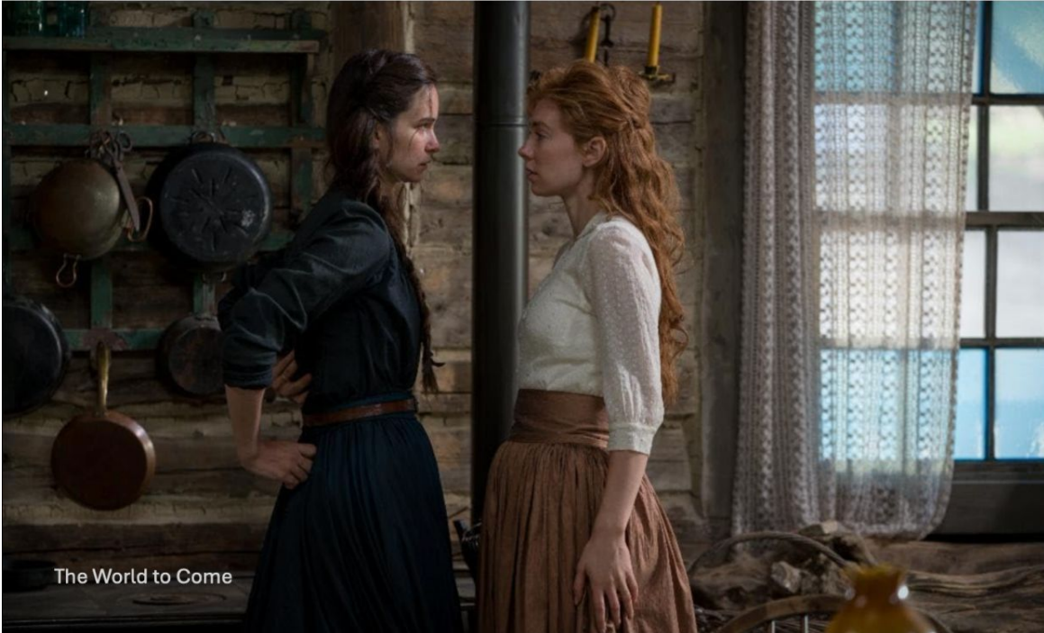
The World to Come